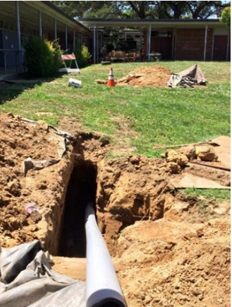
Bond-supported Sewer Repair Projects at Novato HS and Olive ES were completed during Summer 2017

The bond targets the upgrade of aging classrooms, science labs, libraries and facilities to meet current academic/safety standards; provides dedicated space for science, technology, engineering, math, arts and music instruction; and improves student access to modern instructional technology. These improvements accommodate modern teaching and will help prepare our students to compete in the 21<sup>st</sup> Century global economy. Repairs and improvements necessary to protect student safety, and to save money by increasing energy-efficiency are also part of the scope of Measure G. Unlike the District's