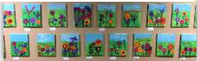
Canvas paintings done by 3rd graders at San Ramon Elementary School.