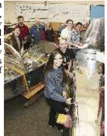
San Marin STEM students' airplane scheduled to fly in 2020-21.