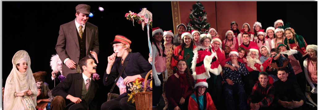
Fools! Production by Marin School of the Arts (MSA) Novato High students