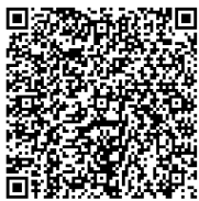
NUSD Scan Code

Each box contains two tests. Only one of these is needed for post-holiday “return to school” testing. The other test should be used for testing students or staff who may have COVID-19 symptoms, whenever this may occur. Please make sure at least one test is reserved for back-to-school testing. If you use the test for symptoms, follow the same reporting instructions. Report the results, whether they are positive or negative.