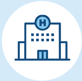
PART A Hospital Insurance