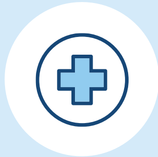
PART B Medical Insurance