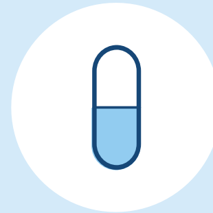
PART D Prescription Drug Coverage